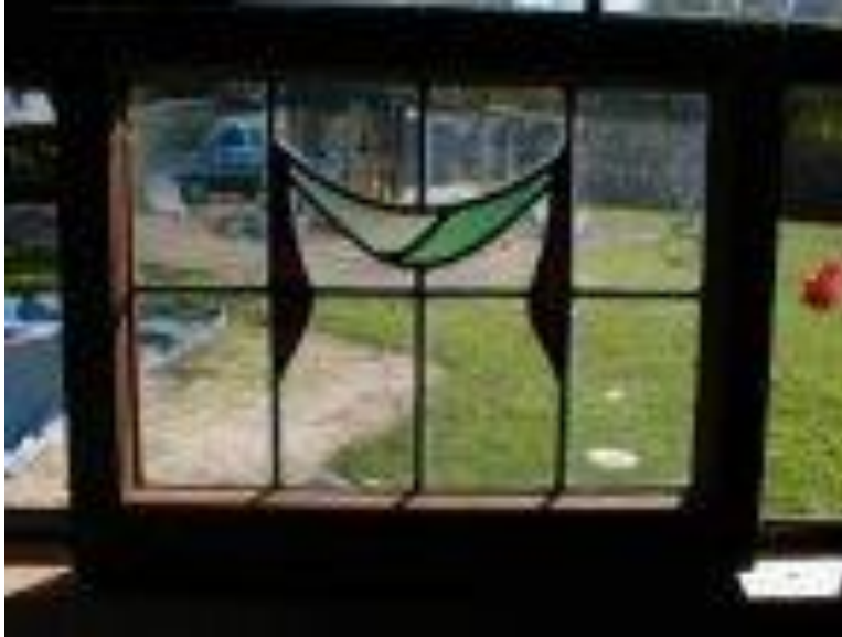
The original image