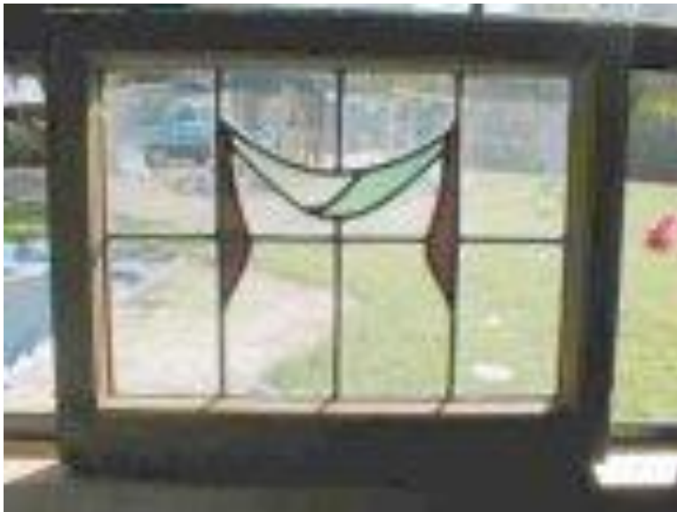
The linearly modified image